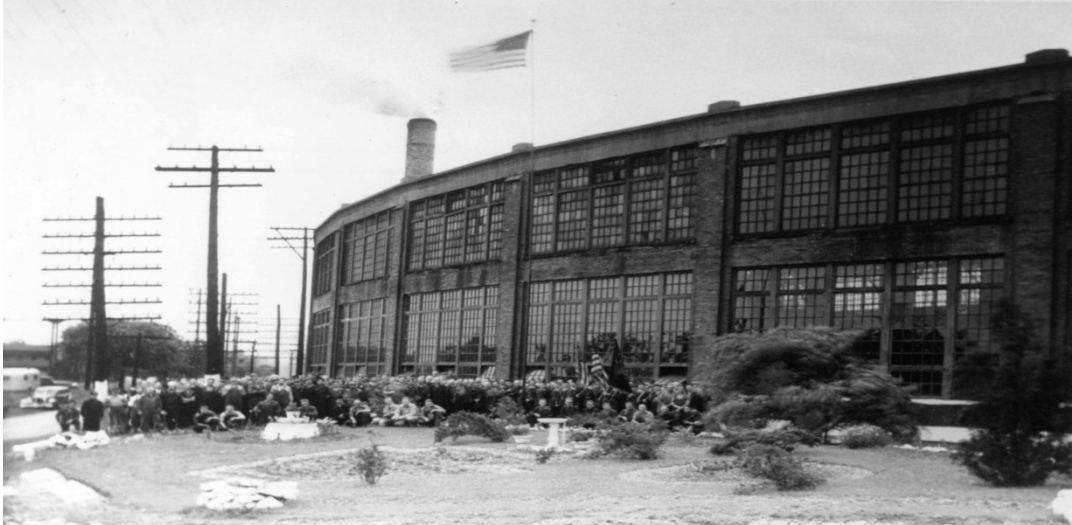
With American Flag and coal smoke blowing in a strong wind, the shop men at the Crestline roundhouse are gathered outside the north end of the huge 30 stall engine house for a special ceremony. The PRR's engine house was in full operation in this circa 1940's exposure.

Modelers & Rail Artifact collectors. There is lots of table space in the meeting room. This is a good chance to display models you have constructed, built, assembled, etc.. Completed models are welcome as well as works in progress. History artifacts on display always show well and are seen with great interest. Bring you models & items for show. And now, 'A Look Back' at yesterday!