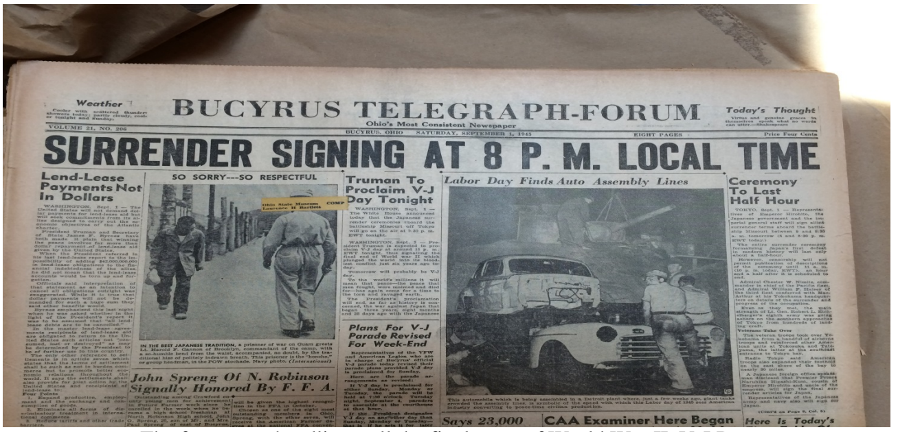
The front page headlines tell the final story of World War II, V-J Day. Bucyrus Telegraph-Forum September 1, 1945.