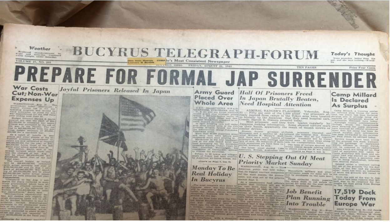
August 31, 1945 Bucyrus Telegraph-Forum.